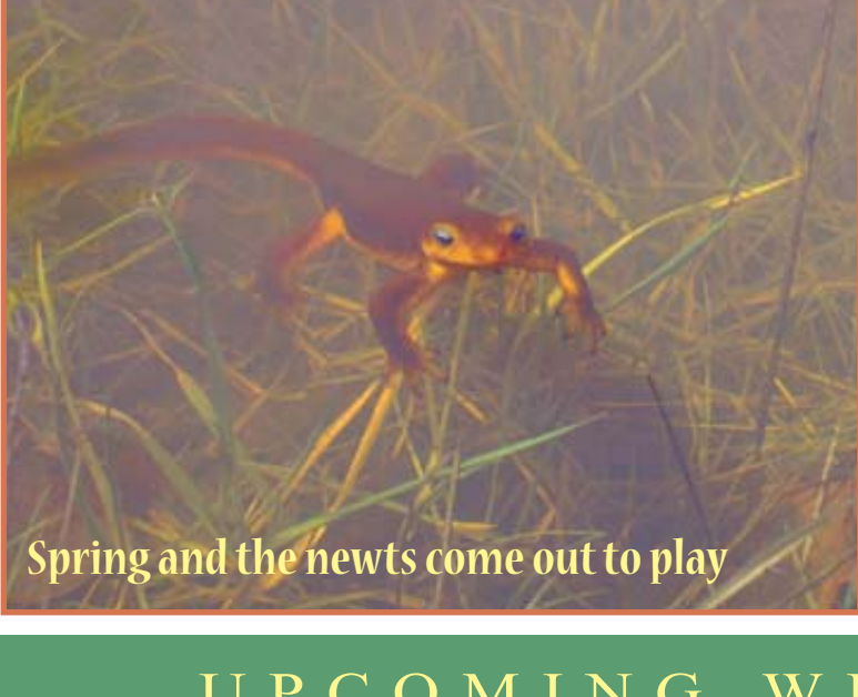
Spring and the newts come out to play

We at Wilbur are looking forward to conspiring with you. Pay it forward and act with beneficence.