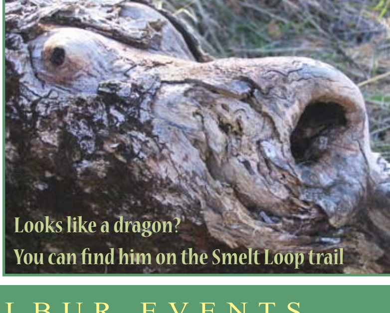
Looks like a dragon? You can find him on the Smelt Loop trail