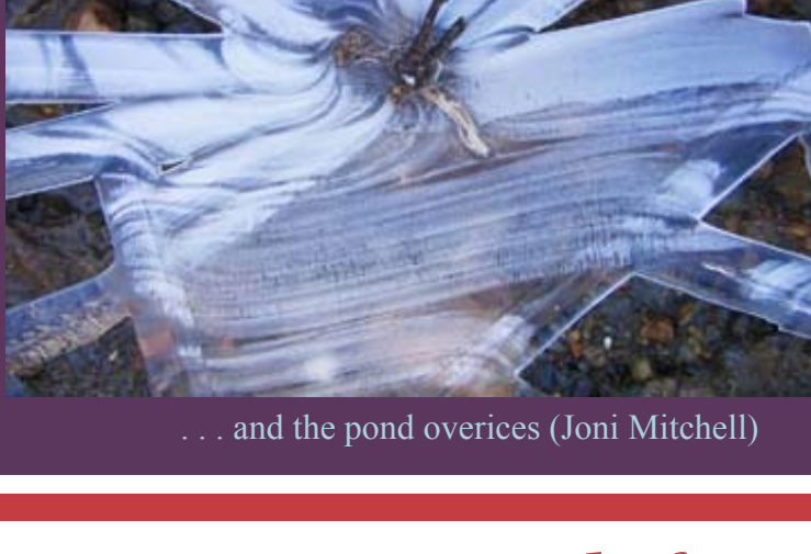
... and the pond overices (Joni Mitchell)

For more information and reservations call 530/473-2306.