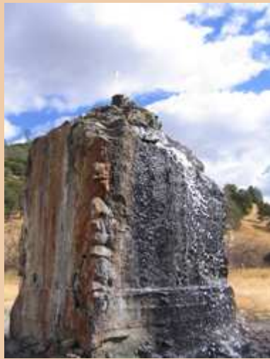
Visit Wilbur's Fountain of Life geyser, located on the Wilbur Nature Preserve.

is a free-form retreat, unobstructed by structure or dogma, self-directed by mutual respect and the creation of everyone who comes here. In short, it's organic." - RD