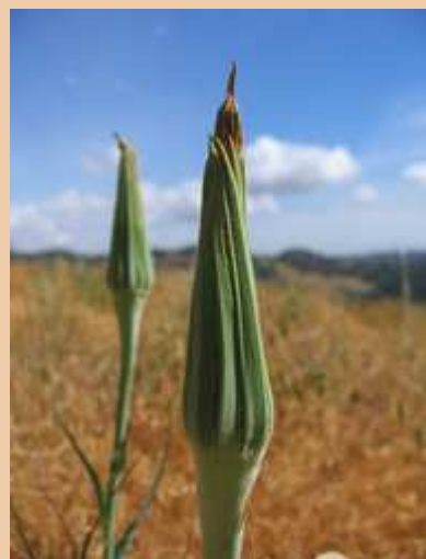
"Wilbur Hot Springs"

To sustain Wilbur Hot Springs, a sanctuary, for healing and personal reflection communing with others reuniting with nature laughing, loving and basking in the quiet awe of it all.